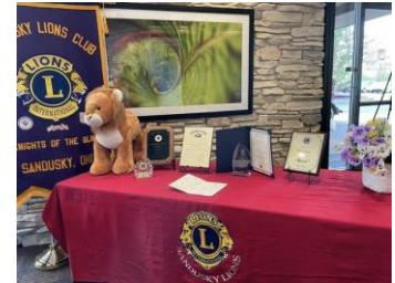
Our display at Sawmill Creek Lodge