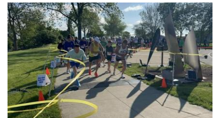
Running Laps Sunday