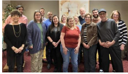
Prospective Lorain Lions Members gather for a Photo

hearing from more people the desire to be of service to the community, "and that's what Lions are all about We Serve".