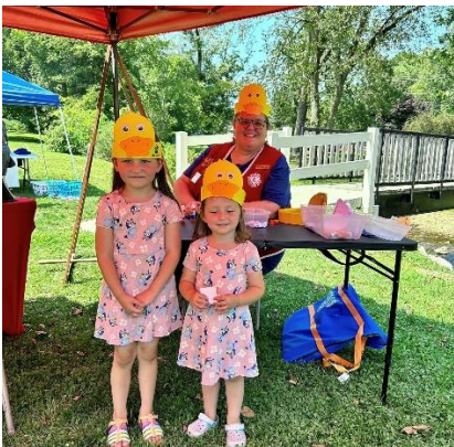
Duck Race Head Bands

We look forward to hosting the Ontario Lions in September, holding our first meet the Lucas Lions Membership drive in October, and Bingo in November. Bingo tickets go on sale on August 31 during the Lucas Car Show or by calling 419-612-9113. Bingo tickets are $35 each or $280 for a reserved table of 8.