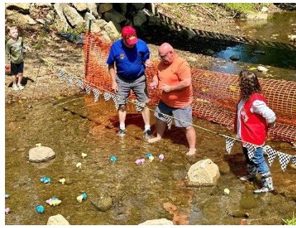
Finish Line for Duck Race