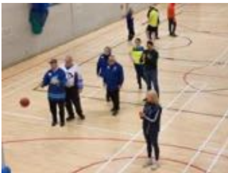
Board Members playing basketball with Special Olympians in Killarney.