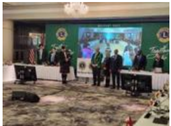
Opening ceremony at the Belfast International Board Meeting.