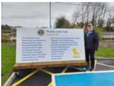
We had the opportunity to visit with the very active and committed Lions of Thurle.