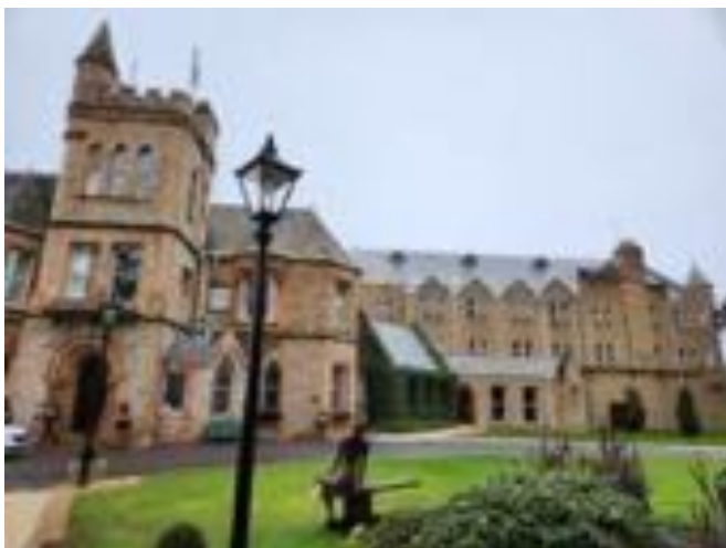
Cullodeen Resort, where we met (and stayed) in Belfast.

Before departing Dublin, time was set aside for seeing this historic city and we chose to spend most of our free day touring Dublin Castle, the administrative center of British rule from 1200s to 1922. Today it is used by the President of Ireland for public ceremonies. During our long flight home, we were still pumped up from witnessing all of the good works done by the Lions of Ireland and how the Lions Clubs International Foundation supports our mission of helping those in need globally.