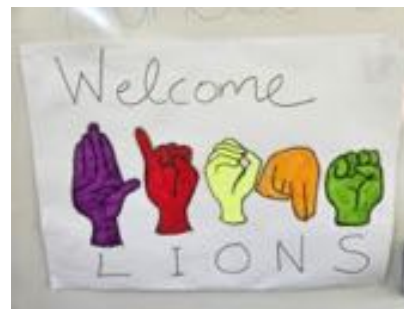
A visit and service project at Holy Family School for the Deaf.