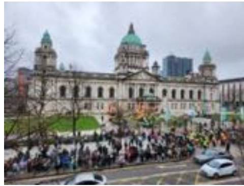
Above, scenes from the Belfast parade. To the right, the wall that divides the Catholic and Protestant neighborhoods of Belfast.