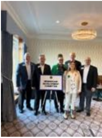
My colleagues from the International Membership Development committee