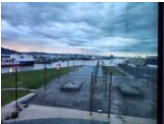
The dock, in Belfast, where the Titanic was built.