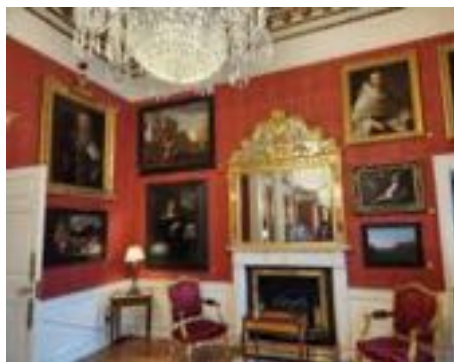
The majestic Dublin Castle, inside and out!