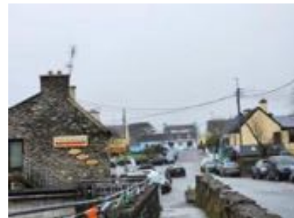
Actress Maureen O'Hara hung out in the picturesque village of Sneem when not in Hollywood.