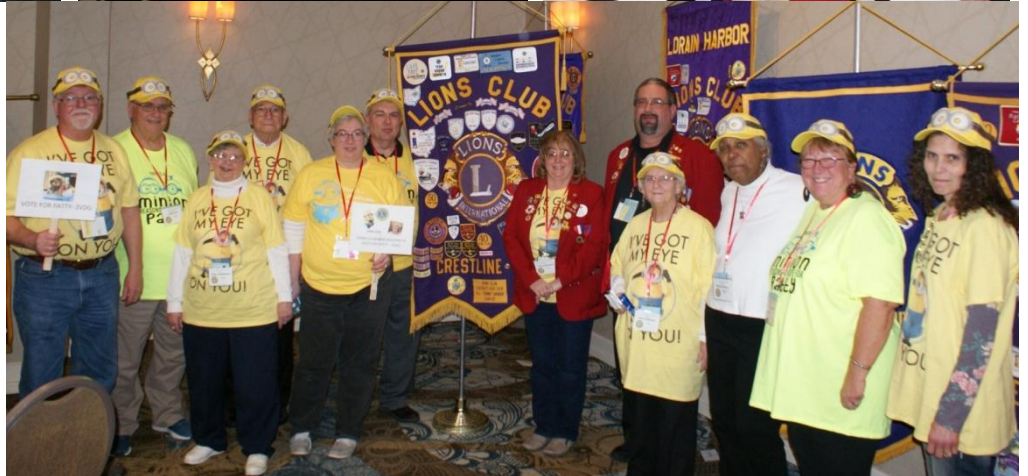
LIONS DISTRICT OH2 Convention Awardees: