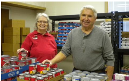
Assembling meal kits.