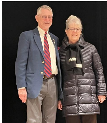
International Director on the stage at Cedar Point.