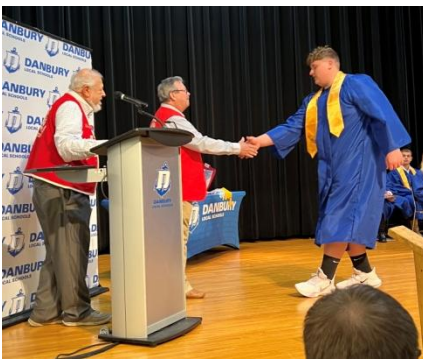
Marblehead Lions Scholarship Recipient