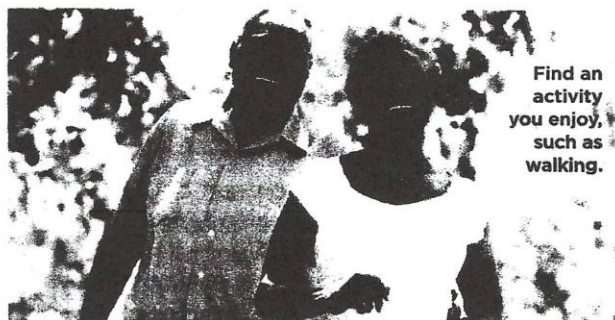
Find an activity you enjoy, such as walking.

For more information from the American Diabetes Association, visit professional.diabetes.org/PatientEd or call 1-800-DIABETES (342-2383).