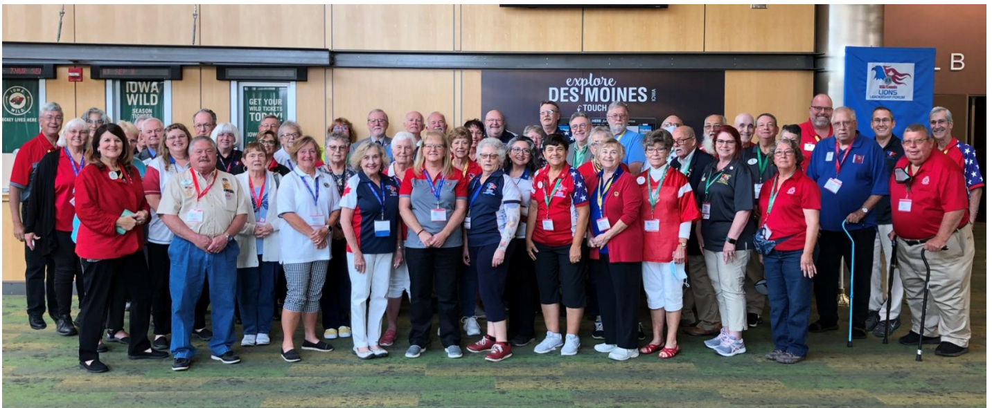
Group photo of all those that attended the USA /Canada forum held in Des Moines Iowa September 9 – 11 2021