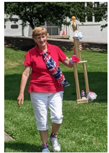
Returning with trophy for the Float.