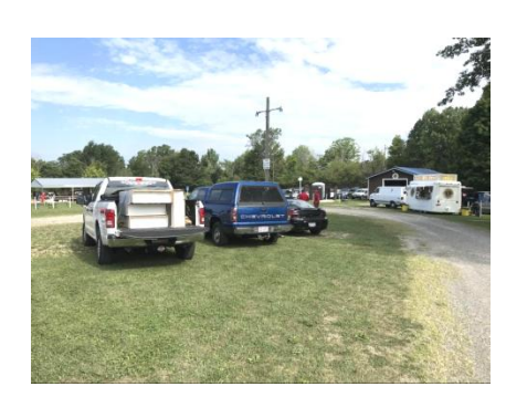
Perrysville Lions News