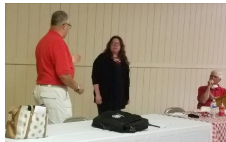
Officer Installation and new member Installation Photos