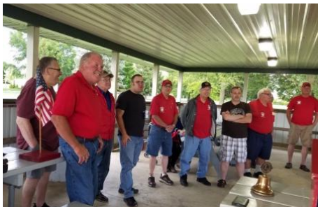
Officer Installation Photos