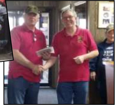
First runner up—Ashland Evening (Thanks to 2VDG Kevin for information)