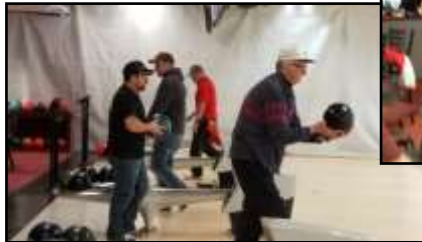
(Thanks to PDG Pete for information)