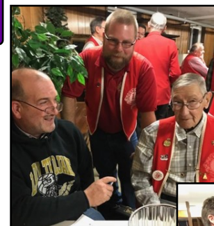
Lions at Zone 3 Advisory meeting.