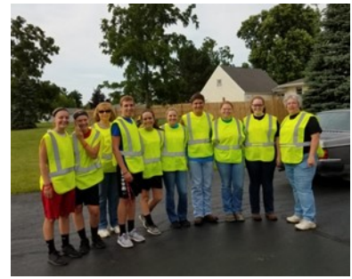
PHS Students at highway clean-up

In August we will be working at our food booth at the Silver King Festival, conduct another highway clean-up and host our sponsoring Club, Ashland Evening Lions, for a picnic.