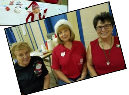
Christmas in July Bloodmobile