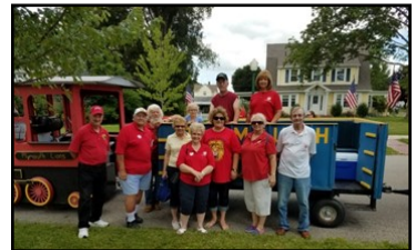
Shelby Bicycle Days parade