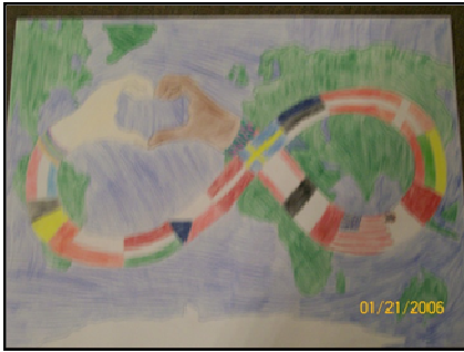
Sycamore Peace Poster 1 st place winner