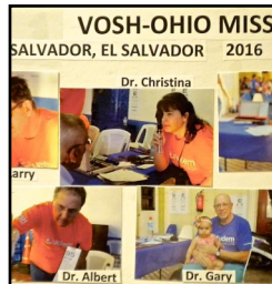
Eyeglasses Mission Information.