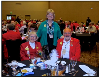
Dining, surrounded by a sea of Ohio red jackets.