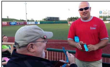
to Zone 4 Lions newest cause, establishing Project Lifesaver service in Lorain County.