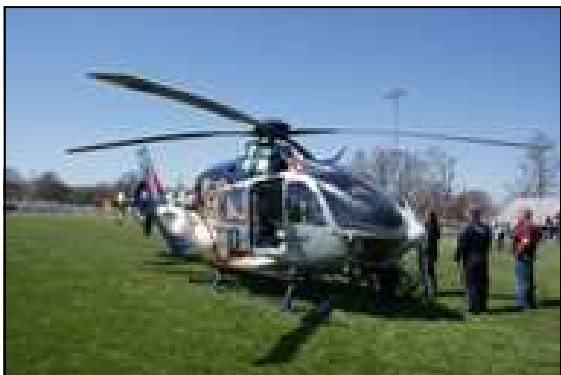
Leo Convention 2016