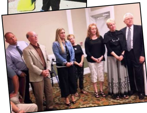
New Member Installation Banquet