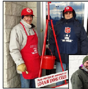
Lorain Lion Bell ringers: