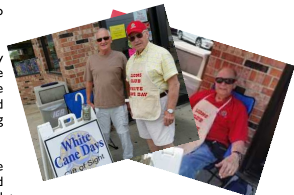
White Cane Days in Tiffin!